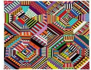
Everything All at Once