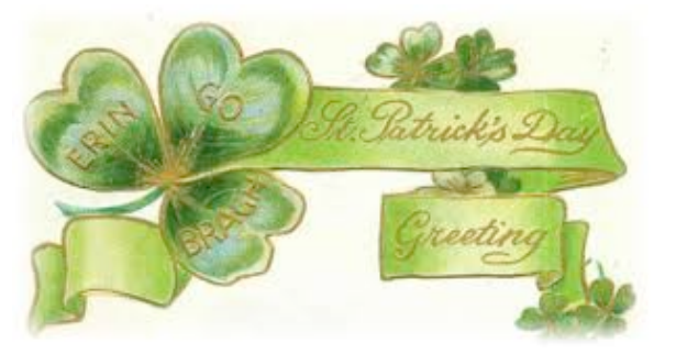
Riverwalk Quilters Guild