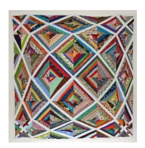
Programs Remaining Guild Year June 2022