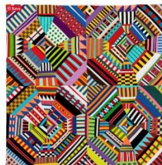
Everything All at Once